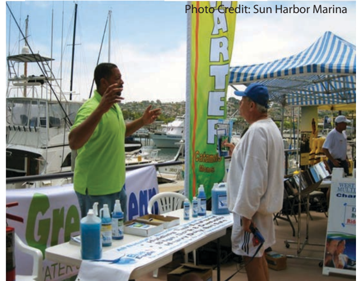
Sun Harbor hosted the National Marina Day event in 2011, promoting green boating products to the public.

Sun Harbor encourages all employees to use other modes of transportation to get to work, such as walking or biking, and bike racks are provided on site. Environmentally friendly cleaning products are used in the workplace to maintain employee and customer health. Sun Harbor Marina sends out a monthly e-newsletter to keep the public updated on events and showcase green practices. The marina also sponsors National Maritime Day, where green products can be promoted to the public and tenants.