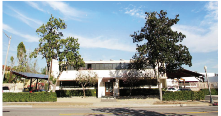
The Sapphos office building in Pasadena, California boasts a LEED certification, energy efficient appliances, and low flow fixtures for water, and photovoltaic solar panels.