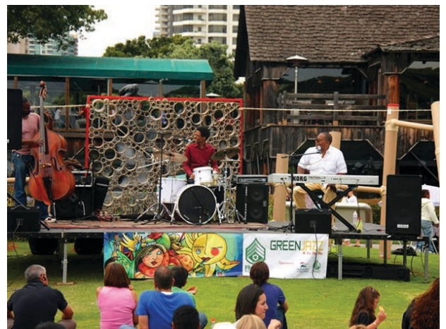
Live music at the 2011 RECONnect Festival in San Diego. Check www.reconnectfest.com for future event dates.

“Climate friendly actions are weapons of mass construction ... Our air and oceans do not stop at borders. Climate friendly actions at the local level are the most important global environmental solution.”