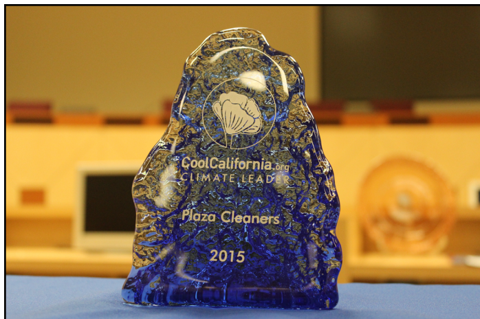
The Climate Leader Award that was given to Plaza Cleaners in recognition of their green efforts