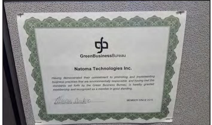
Natoma Technologies received a Green Business Bureau Certification in 2015 for their sustainable actions.

The company is proud of their Center for Digital Government awards and their Green Business Bureau certification. In 2015, Natoma Technologies obtained Green Business Bureau Gold Standard certification. This is a third-party certification which demonstrates Natoma Technologies’ strong commitment to conserving the environment. They aim to influence the community