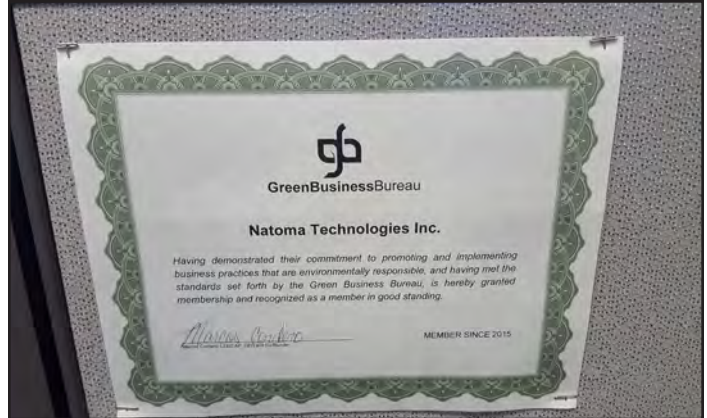
Natoma Technologies received a Green Business Bureau Certification in 2015 for their sustainable actions.

The company is proud of their Center for Digital Government awards and their Green Business Bureau certification. In 2015, Natoma Technologies obtained Green Business Bureau Gold Standard certification. This is a third-party certification which demonstrates Natoma Technologies’ strong commitment to conserving the environment. They aim to influence the community