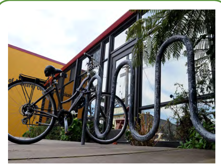
Nearly 40 percent of Monterey County Weekly employees use alternative methods of transportation to commute to work.

Monterey County Weekly composts all yard and food waste. Monterey County Weekly takes an active approach to promote alternate transportation. By encouraging employees to take alternate forms of transportation such as biking or carpooling, and in fact, nearly 40 percent of employees rely on biking, walking, carpooling, or telecommuting to work. Monterey County Weekly has also written green principles into the employee handbook to ensure that all staff uphold a level of environmental awareness.