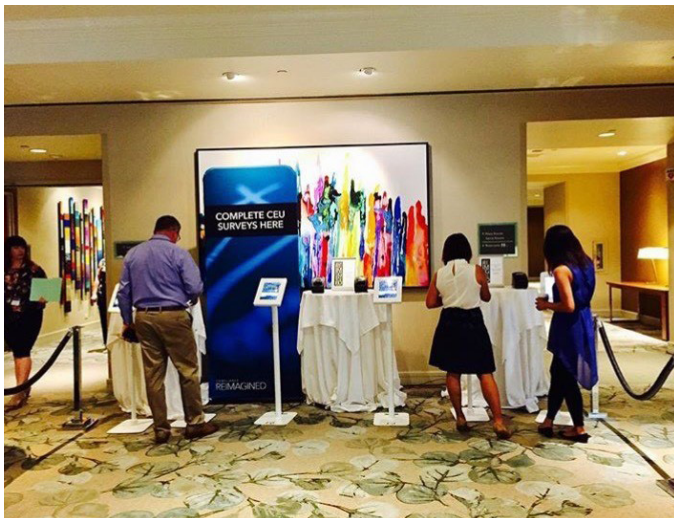
California Hispanic Chamber VIP check-in setup.

MCE staff come into contact with a large and diverse range of people through the numerous events they host. Staff use this opportunity to remind attendees to be environmentally conscious with flyers that state “reduce your carbon footprint”. This message was even incorporated onto the back of MCE’s business cards. Over time this message has reached thousands of people across the Sacramento region.