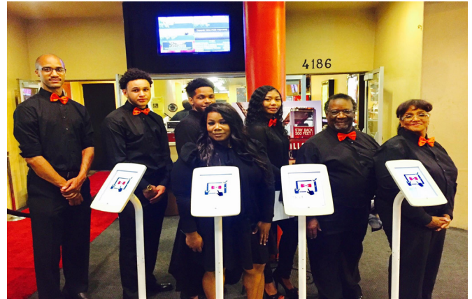
MCE concierge team hosting the Oakland Movie Premier: Confirming Stills.