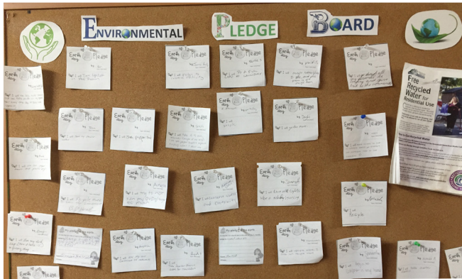
Environmental Pledge Board at Crestwood Healing Center for patients and staff.

Other facility upgrades include the installation of overhead LED lighting, recycling and composting programs, high-efficiency appliances, a green purchasing policy, and much more. Staff and residents also found that upcycling waste products into works of art is a great way to connect with the planet. From planters to office decorations, Crestwood Healing Center knows how to put a fun and creative spin on waste reduction.