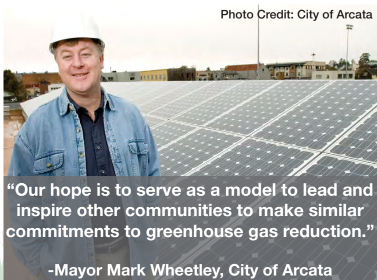
Arcata's Mayor Mark Wheatley poses with the City Hall solar panels, which save $2,000 a year.

Arcata is making strides to reduce emissions as the City reduced 7,370 metric tons of CO 2 in the community between 2000 and 2006.