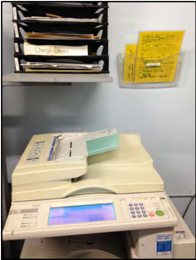
Laminated sheets are scanned into their digital records system and then rinsed to be used again and again

hospital if they sign up for clean energy, or RECs for their home. Capitola Veterinary Hospital upgraded their dated analog thermostat to a programmable ENERGY STAR thermostat, to conserve energy and gas. They ceased advertising in the yellow pages and instead began to market their business online, which proved to have a much greater return on their investment. Capitola Veterinary Hospital's cumulative efforts and achievements make them an eco-friendly model for other hospitals and small businesses to follow.