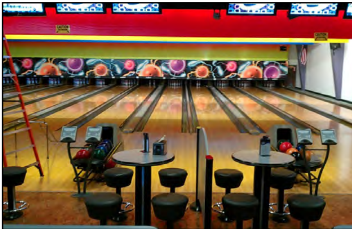
Capitol Bowl remodelled their facility, resulting in over $5,000 in monthly energy savings

Capitol Bowl's efforts don't stop at its green building features. They support internal and external outreach projects to promote sustainability. They encourage employees to bike to work and source food from local farmers. The manager is a board member on the West Sacramento Chamber of Commerce, participates in the City of West Sacramento's sustainability efforts, and volunteers every week at the local farmer's market. She frequently speaks with other businesses about measures they can take to reduce their carbon footprint, including referring them to the