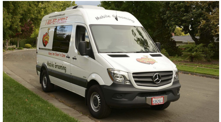
The Aussie Pet Mobile van utilizes a rooftop mounted solar panel to power their equipment and runs on a clean diesel engine.