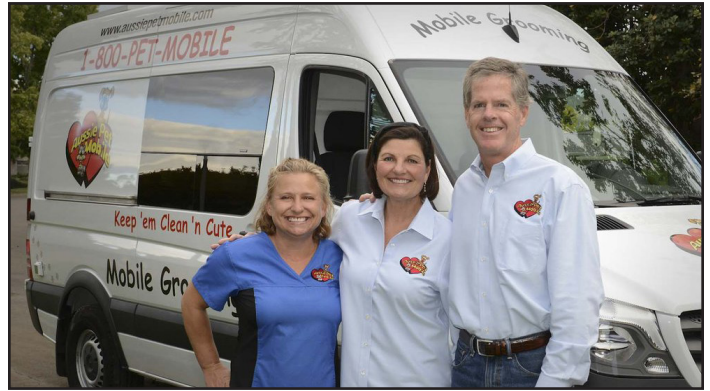
Aussie Pet Mobile has established an Environmental Policy, incorporating sustainability into their internal and external business operations.

In the spirit of continual improvement, Aussie Pet Mobile has adopted an Environmental Policy Statement that incorporates sustainability into their core internal and external business operations. The policy includes commitments to reduce, reuse, and recycle, conserve natural resources, purchase environmentally preferable products, and promote outreach and awareness. They have established an employee education program and constantly look to their employees, suppliers, and customers for ways to become more sustainable.