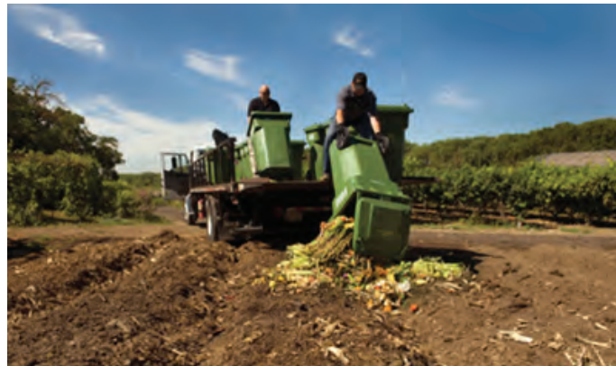
Atlas Disposal's food waste collection program gives eateries small containers for produce scraps, which are taken to a vegetable farmer who composts.

"Our achievements in technology, innovation, and customer service are helping residents and businesses in the Sacramento community do more than just think about the environment.... We're helping them preserve it!"